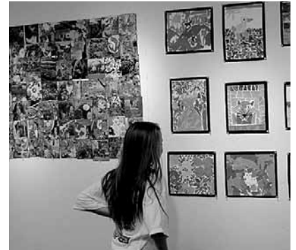
Viewing the Exhibit