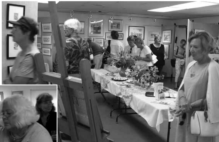
The July Open Studio Tour had almost 500 visitors, and the August Tour had even more!