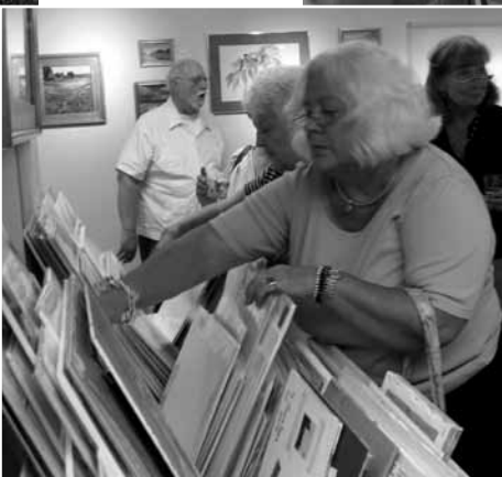
Left, the bin at the Summer Show