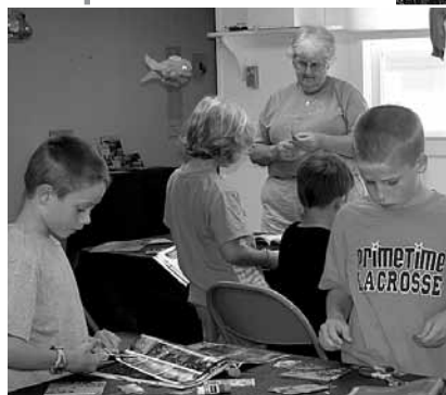
Week 2, making tiles with torn paper