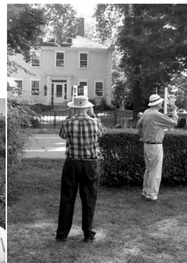
Monday Morning Painters working hard at Town Lot in Little Compton.