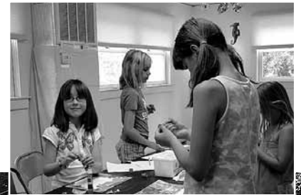
Week 1, painting with torn paper