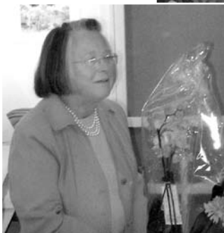
Annual Meeting & Potluck Supper