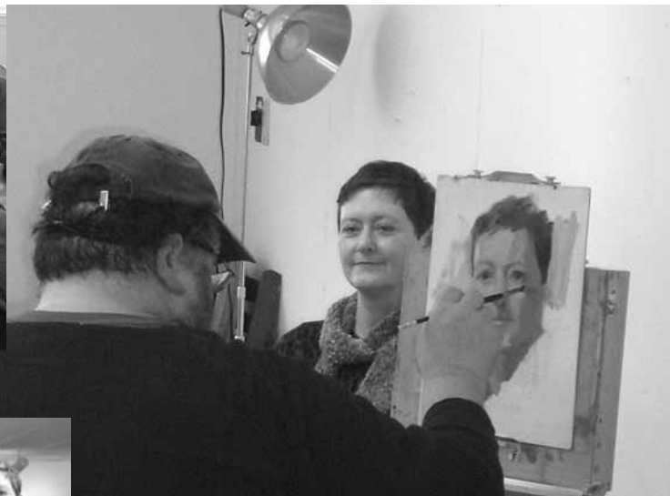
The artist at work