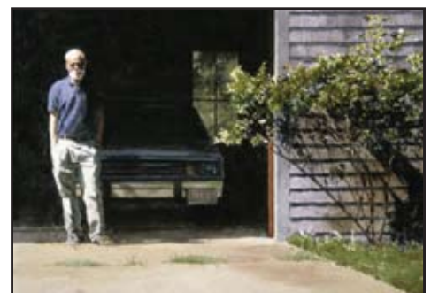
Westport Garage, 1996 watercolor by R. Bechtle

Whitney Chadwick is an art historian and who writes in the areas of surrealism contemporary art and gender studies. She has taught Modern and Contemporary Art at San Francisco State University, Stanford University, Williams College, The Massachusetts College of Art and the Universities of Uppsala and Gothenburg.