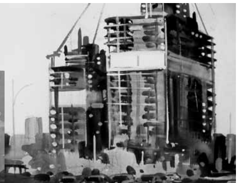
Clockwise from top left: Tropical Fruit, Construction, Flower Vendor