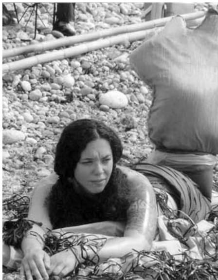
A mermaid was sighted again on the rocks at Little Compton's Town Lot, on July 20.

The Figure Workshop will hold a special session with two models at WAG on Saturday, November 12 from 2–6pm. The fee will be $15 per person. All are welcome. You do not need to be member of WAG or of the weekly workshop to attend. Registration will close on Wednesday, November 9. To reserve your space or for more information, call Carolyn Winter at 401-316-8272.