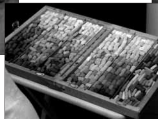
The box of pastels